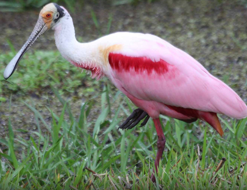
ROSEATE SPOONBILL BY ALEXANDER DZIB