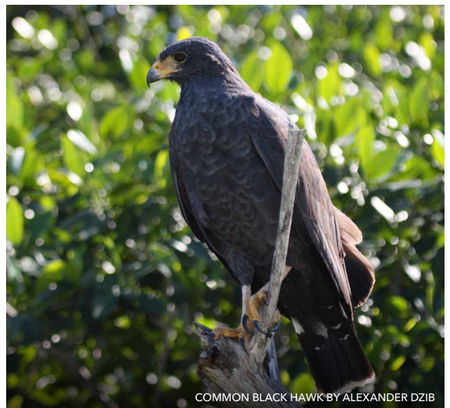
COMMON BLACK HAWK BY ALEXANDER DZIB