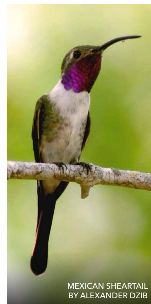
MEXICAN SHEARTAIL BY ALEXANDER DZIB