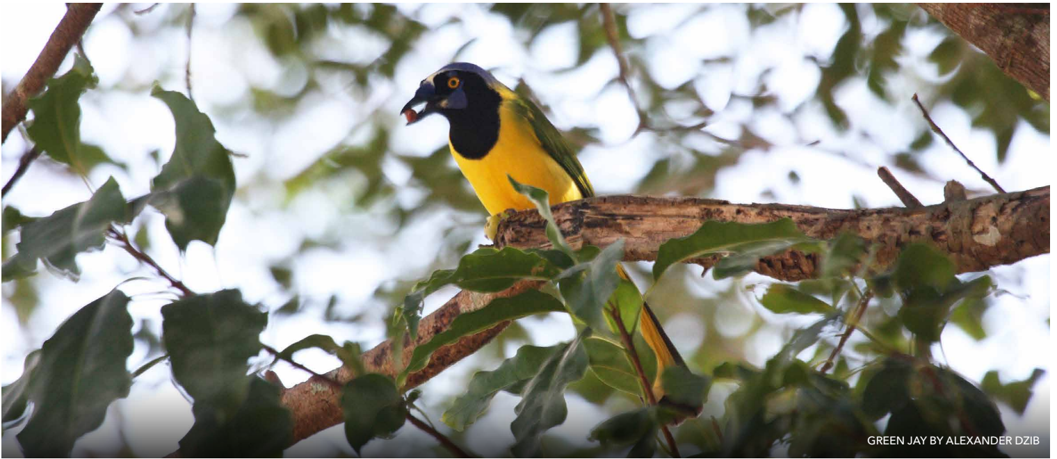
GREEN JAY